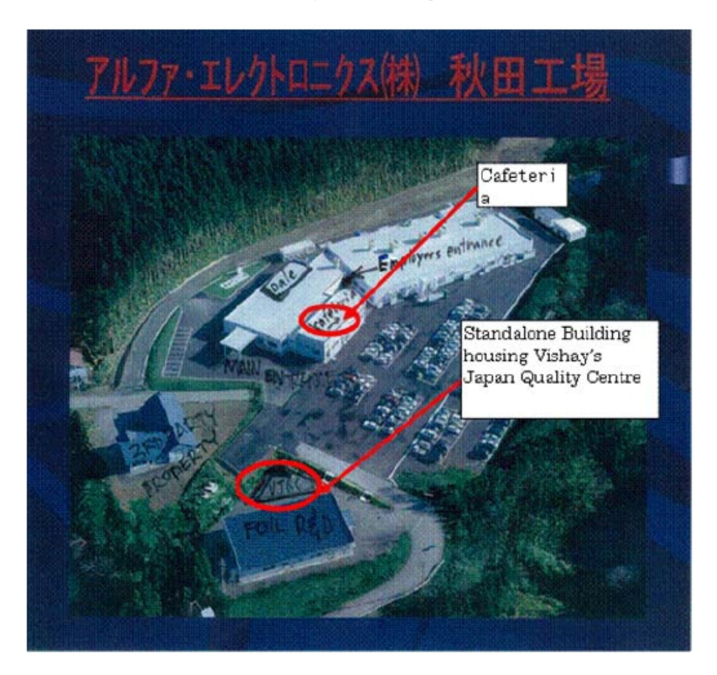
- 9 -